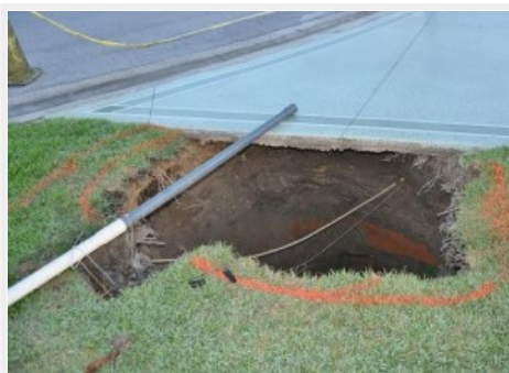
A sinkhole opened up Tuesday in Sabal Chase.