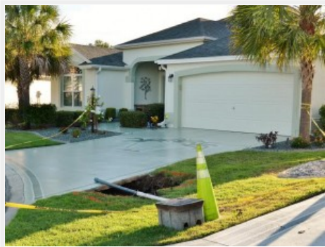
The sinkhole appeared on Tuesday.